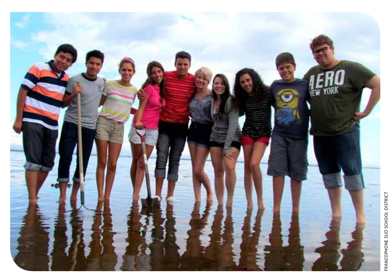
International students clam fishing (immersion camp).

International education initiatives are already under way in the Francophone sector. Existing activities should receive more support, and steps should be taken to develop those components that are missing or incomplete in order to increase and broaden opportunities for educational experiences that open up windows on other cultures and can export local know-how. Establishing multi-sector strategic partnerships (public and private sector) and developing and implementing an innovative business model are essential if we are to take full advantage of the opportunities inherent to international education.