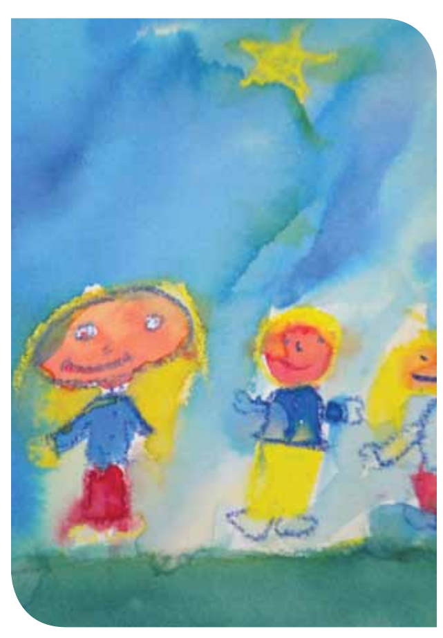
FRANCOPHONE SUD SCHOOL DISTRIC

From birth, offer quality French-language services, programs and resources that include Acadian, Francophone and international cultural referents.