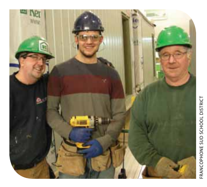
Place aux compétences program, training and work component.

There is no doubt that opening up to and initiating real collaboration with the community will make Acadian and Francophone schools even stronger. It is vital for the survival and renewal of Acadian and Francophone society to set up a constructive dialogue and create real synergy between these two important pillars. If education is a collective priority and a societal project, it naturally follows that all stakeholders must be active contributors to it. In allowing community members to engage more and participate much more closely in the school's educational mission, learning is made more meaningful for the students and their feeling of attachment to the community is nourished.