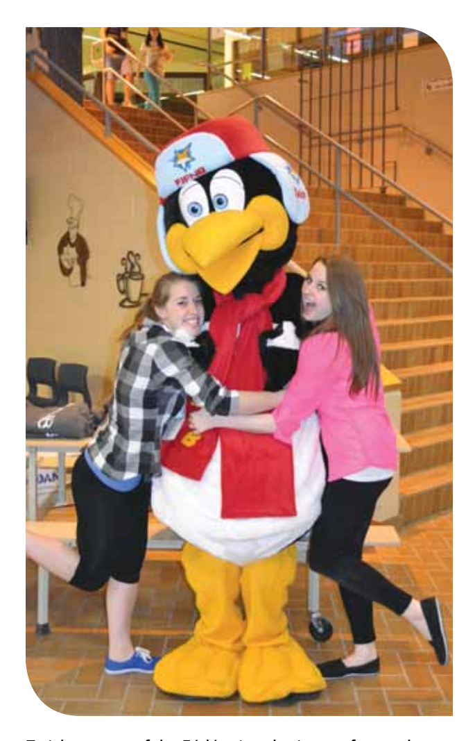
Zwick, mascot of the Fédération des jeunes francophones du Nouveau-Brunswick. (FJFNB).

Enhance the contribution, participation and visibility of Acadian and Francophone youth and the entire community in the traditional and digital media.