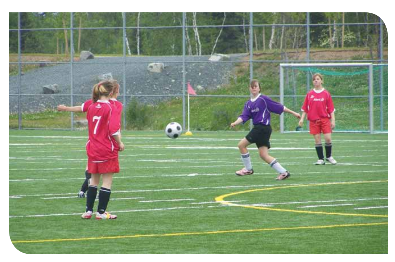
Jeux de l'Acadie.

in achieving common goals. It is also important to create a harmonious, friendly atmosphere that nourishes feelings of equality, mutual trust, attachment, competency, and autonomy. In the same vein, partnerships are cultivated through effective, open, and transparent communication. They are also cultivated through individual and collective accountability and participation in decision making, based on a shared vision and values, as well as on a common understanding of the issues. Last of all, the development of schoolfamily-community relations requires considerable adaptability on the part of educational institutions, particularly through the introduction of mechanisms that promote integration and participation (e.g., planning meeting times and places that are convenient for the various partners).