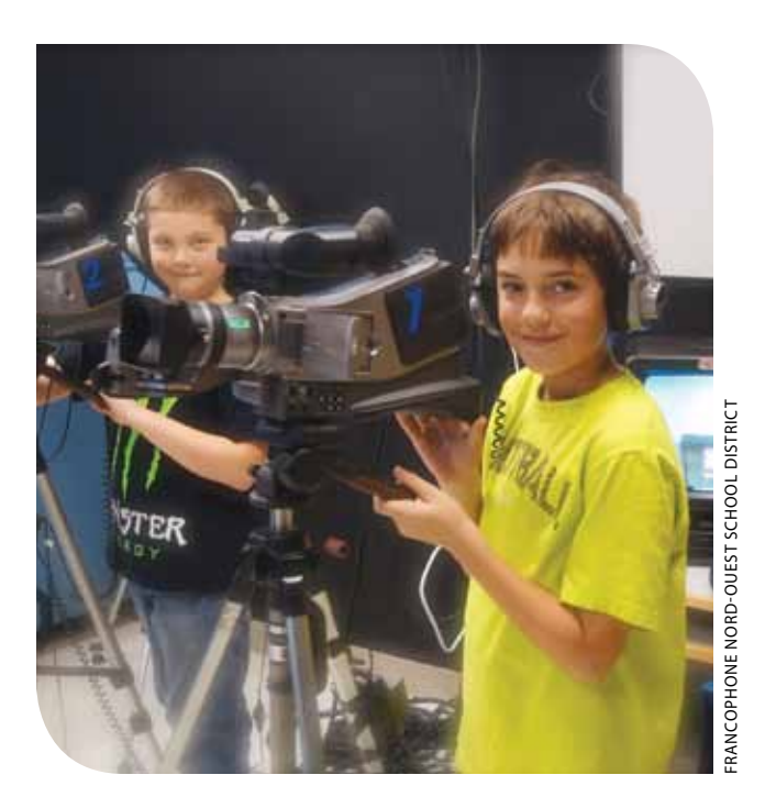
Envol program, Centre d'apprentissage du Haut-Madawaska, Clair, N.B.

Lastly, students must have a say in governance structures and be permitted to play an active role in them. To that end, it is important to review existing structures and redefine the responsibilities of student councils so they can take on a greater role and become involved in the development of programs, policies and school services.