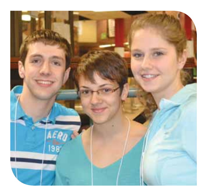
FJFNB youth rally.

All the partners in the education system are collectively committed to building the identity of all members of the Acadian and Francophone community.