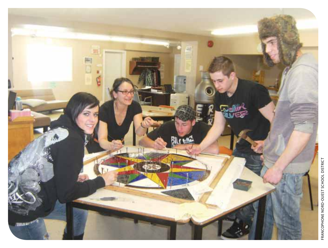
GénieArts Nouveau-Brunswick (ArtsSmarts) program.

Finally, so that schools can make a harmonious transition toward the principle of democratization and student empowerment, it is vital to establish permanent, ongoing dialogue between the government and youth organizations, to ensure that actions of the partners in education are consistent and complement each other. A good deal of effort will be required to develop new youth participation mechanisms