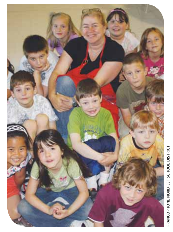
Provincial program Une école, un artiste.

Urban areas also lend themselves to two other phenomena affecting the Francophone minority's resilience: immigration and exogamy. Newcomers choose primarily to settle in cities. However, as indicated earlier, only 13% of them have French as their first language. The social attraction of English is also very strong among Allophone newcomers outside Quebec