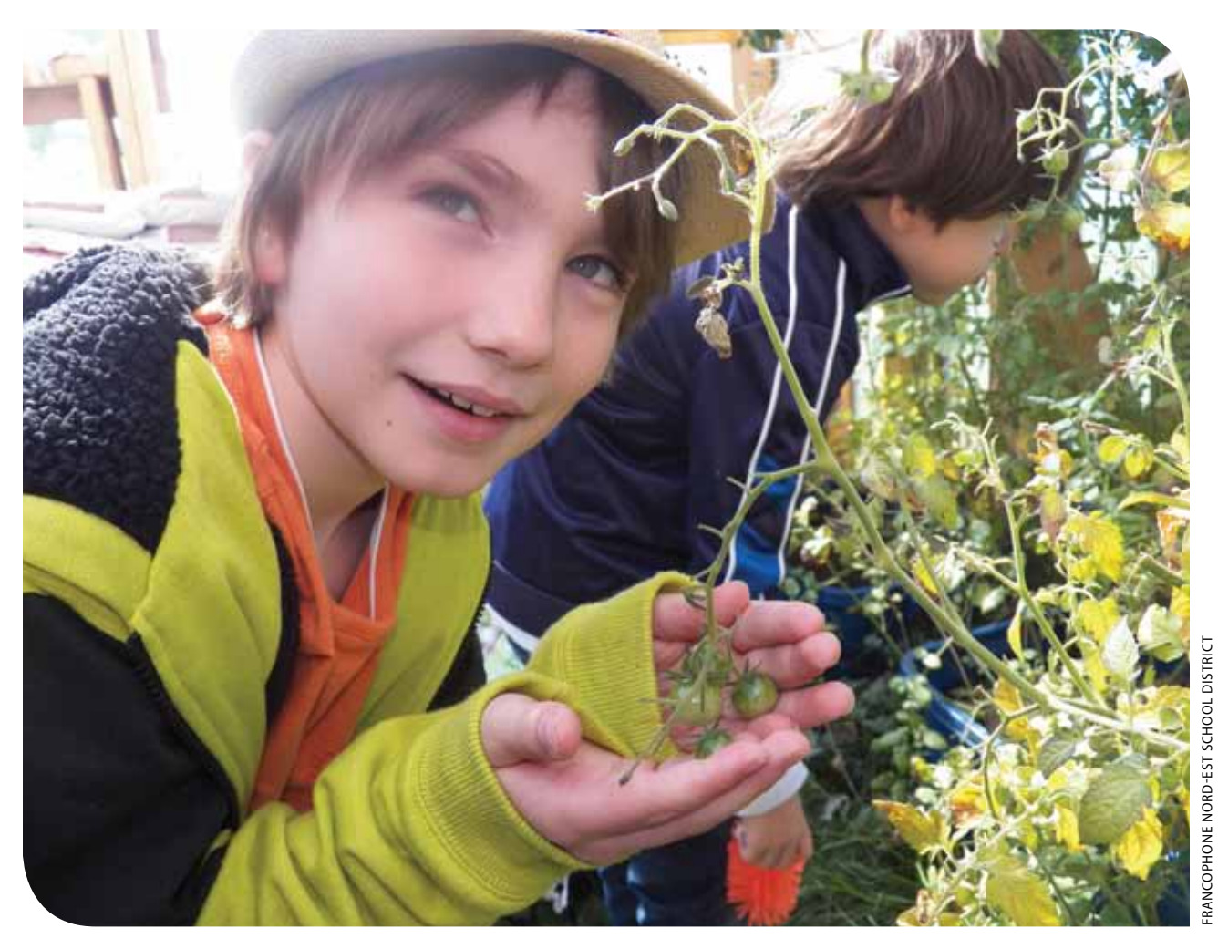
School-community project, François-Xavier-Daigle school, Allardville, N.B.

It is also necessary to identify the skills, knowledge and attitudes sought in teaching staff and school administrators generally in order to develop or update professional profiles and performance evaluation tools for each of these key stakeholders. That way, expectations will be clearly stated and it will be easier to identify the strengths and challenges of each professional and to determine methods of self-improvement, which will then indirectly build the capacity of the teaching staff and principals to discharge the dual mission of the education system. What is more, the professional profiles will make it easier to plan initial and ongoing training toward acquisition of the desired skills. All of the partners working on the development of education professionals should cooperate on building these