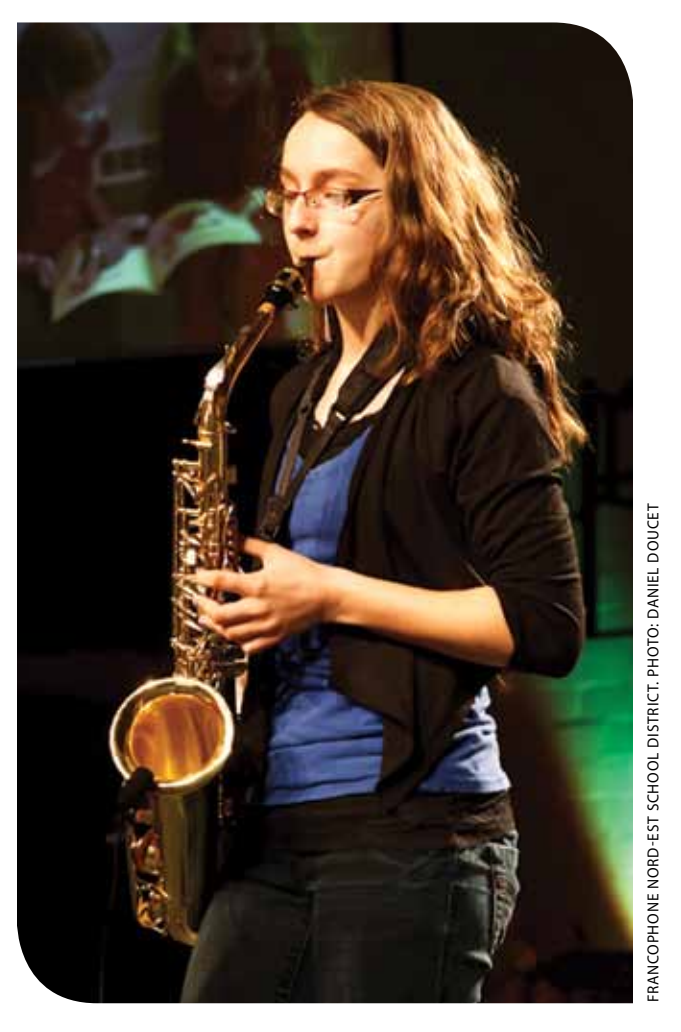
Opening ceremony for Semaine provinciale de la fierté française 2012.