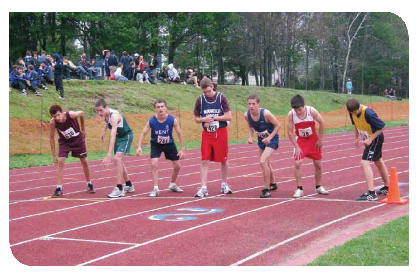
Jeux de l'Acadie.

primary goal of this interdepartmental, intersectoral and community collaboration will be to create conditions facilitating the transitions for students at each stage in their schooling, from early childhood to adulthood. By making an individual and collective commitment, these leaders will be able to decide what has to be done to bring the sectors together, and then identify and carry out the actions that will result in the achievement of the anticipated outcomes of the policy. This group should also work out a continuous improvement mechanism. Such a mechanism should, among other things, assess the impact and effectiveness of the actions in relation to the desired changes, in order to ensure that actions are always cohesive (see Vitality strategy V 5, page 58).