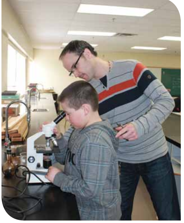
RANCOPHONE NORD-EST SCHOOL DISTRICT

The idea of making students active participants in their learning is certainly not new. However teachers need ongoing training and support to ensure that all the principles of this philosophy are applied in all classrooms.