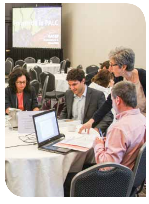
Workshop, LCDP Forum, Fredericton, N.B., June 2013.