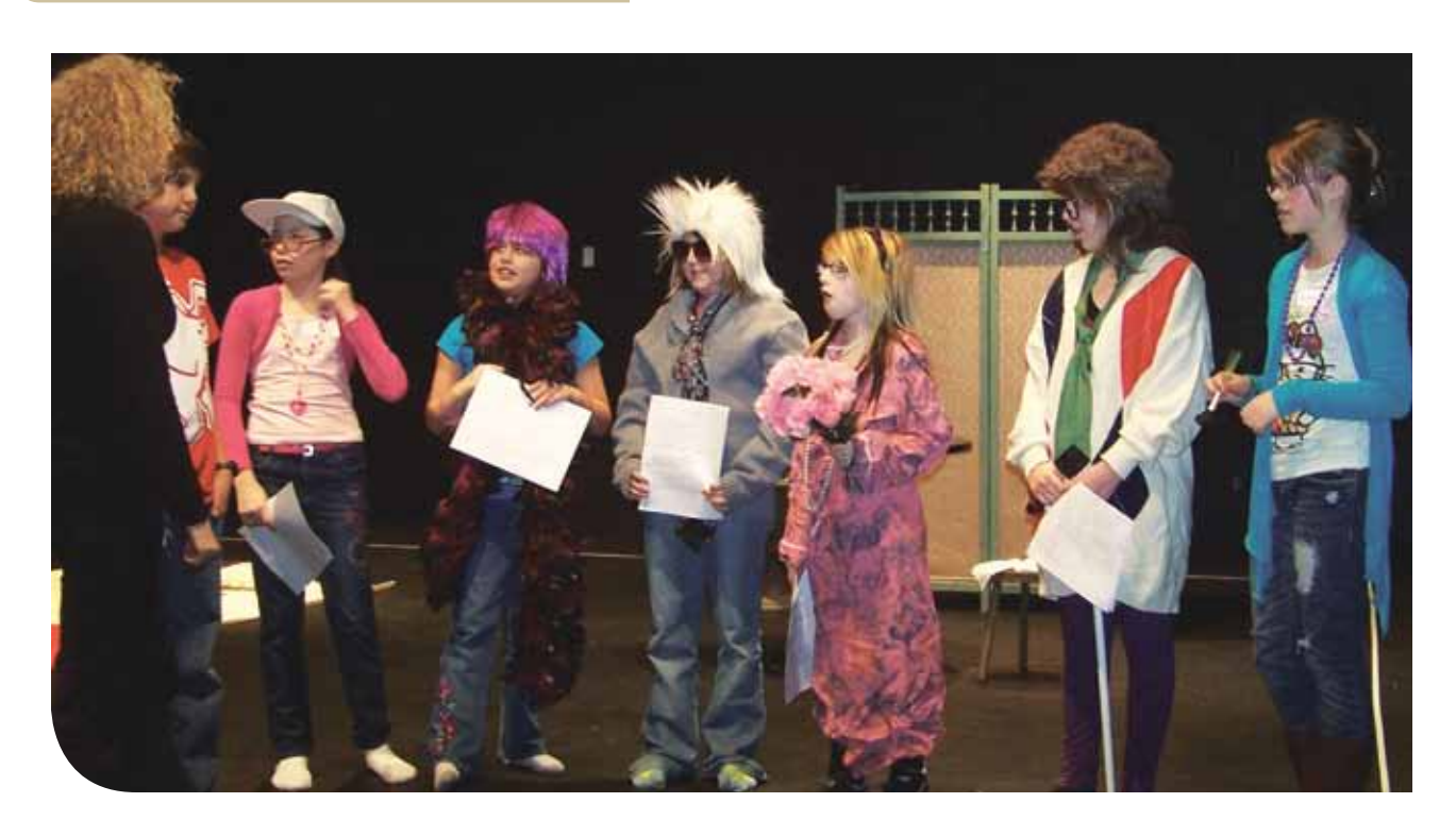
Festival de théâtre jeunesse en Acadie, Caraquet, N.B.

Lastly, the importance of promoting and showcasing the expertise in the Acadian and Francophone education system has to be reaffirmed. The achievements and innovations of its students, teaching staff, researchers, community partners, leaders and administrators deserve to be seen and known, both locally and internationally. By drawing attention to its impressive range of expertise, the education system will support not only its own vitality, but also that of the Acadian and Francophone community, its young people and New Brunswick society as a whole.