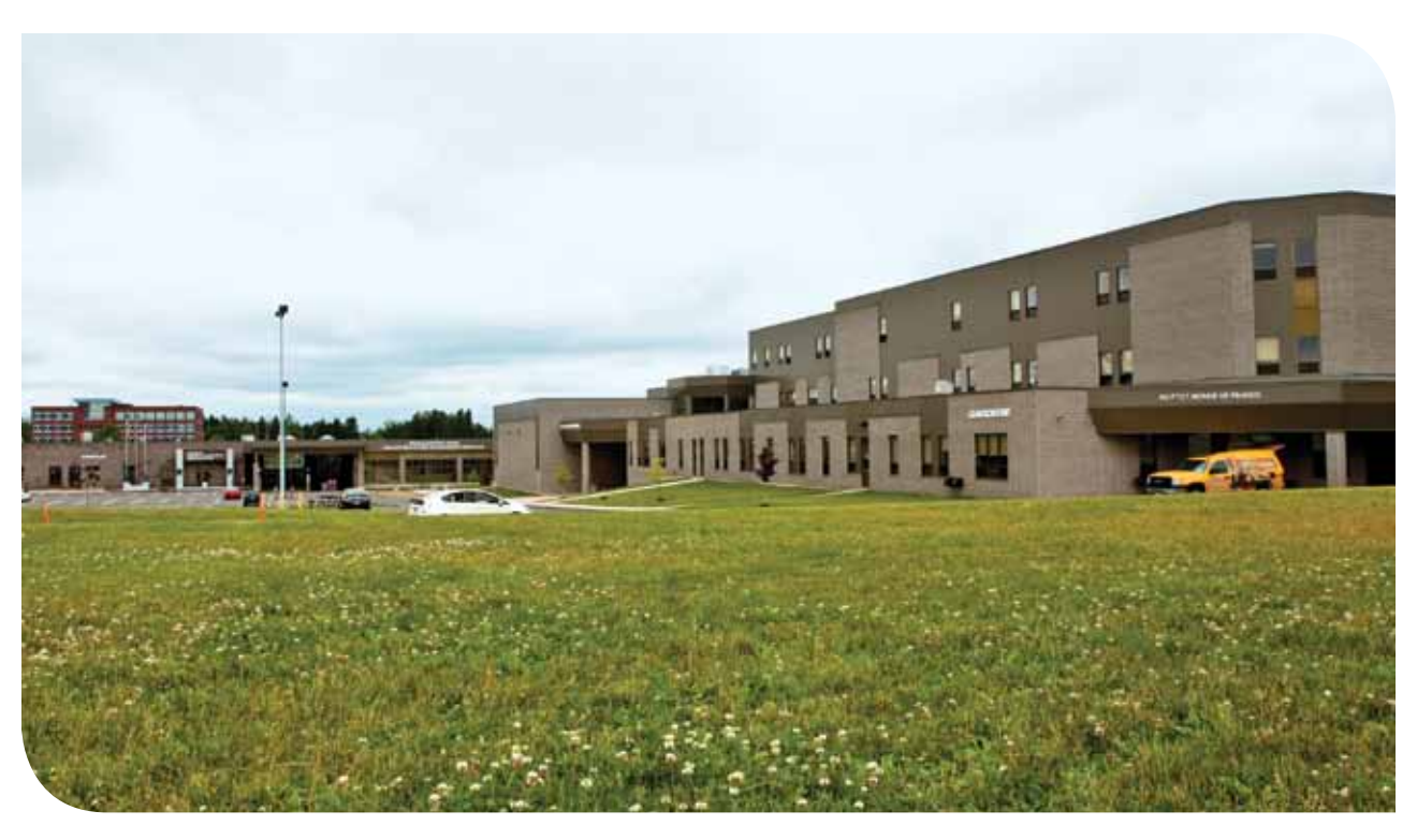
Centre communautaire Sainte-Anne in Fredericton, N.B., the first Francophone school-community centre in Canada.